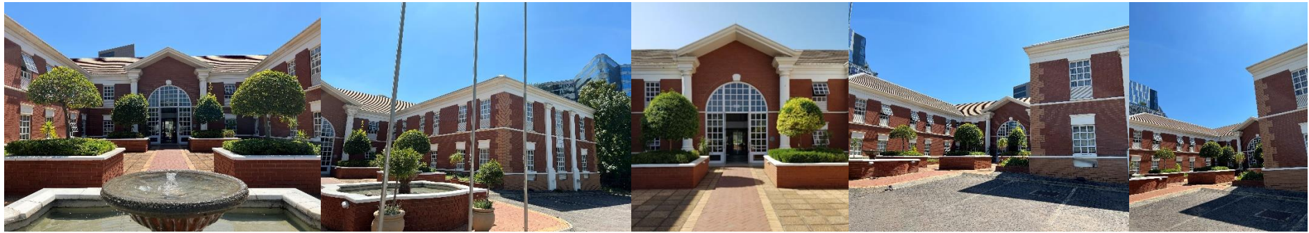
43 Wierda Road West Sandton