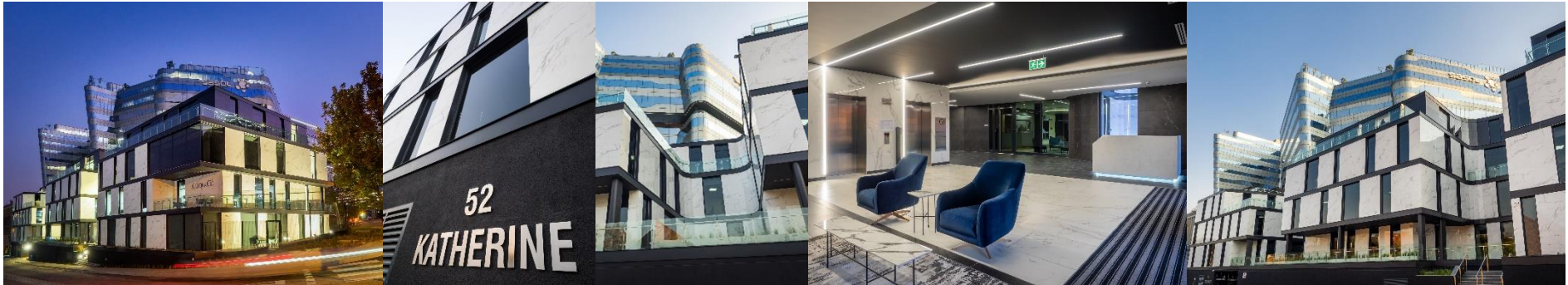
52 Katherine Street Sandton